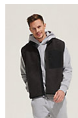
SOL'S FURY BW 04041