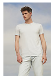
SOL'S MARTIN MEN 02855